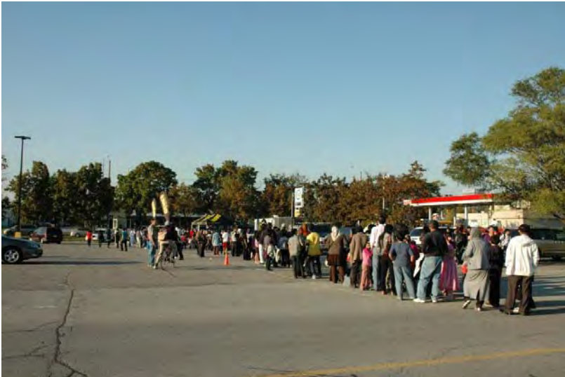
Gears and Morning Glory Cycling Club Bicycle Donation October 7 th , 2011 Thornccliffe Park